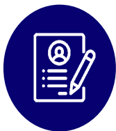
Maths Student Dashboard